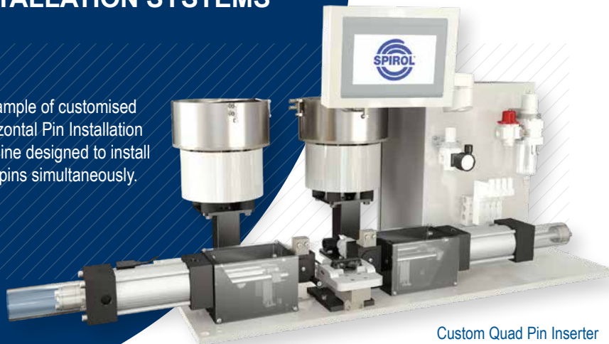
Custom Quad Pin Inserter

Example of customised horizontal Pin Installation Machine designed to install (4) pins simultaneously.