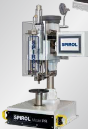
SPIROL Model PR Semi-Automatic Pinning Machine