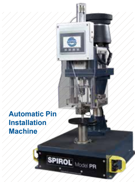
Automatic Pin Installation Machine