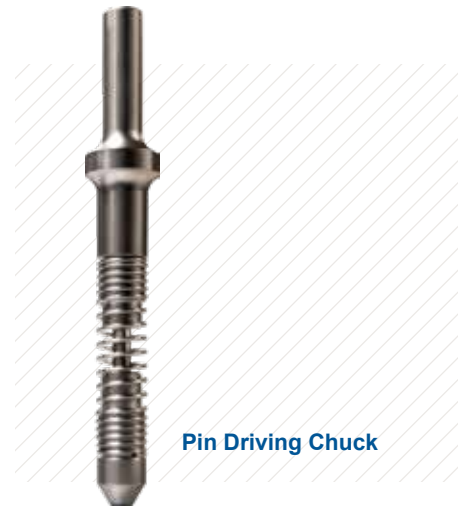
Pin Driving Chuck

Presses and air hammers with pin chucks allow for better axial alignment, control, and quicker cycle times compared to a hammer. These are great solutions for small to medium volume production. Additionally, pin driving chucks are cost-effective and versatile tools that allow manufacturers to control alignment and insertion depth. Furthermore, the chuck will hold the pin securely in place prior to and during installation. The pin driving chuck has an internal punch with a diameter smaller than the hole but greater than the pin's chamfer diameter. This is critical for effective installation.