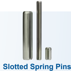
Slotted Spring Pins