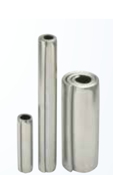
Coiled Spring Pins

SPIROL Korea 160-5 Seokchon-Dong Songpa-gu, Seoul, 138-844, Korea Tel. +86 21 5046-1451 Fax. +86 21 5046-1540