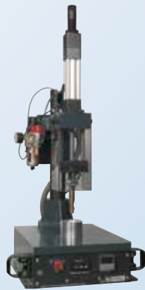
Insert Installation Technology