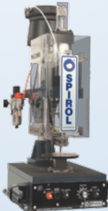
Pin Installation Technology