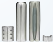
Rolled Tubular Components