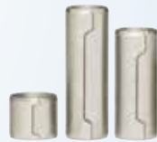
Ground Hollow Dowels