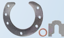
Precision Shims & Thin Metal Stampings