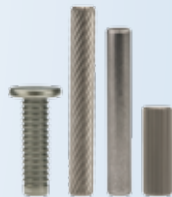
Solid Pins & Drive Studs