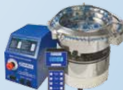
Parts Feeding Technology

SPIROL Application Engineers will review your application needs and work with your design team to recommend the best solution. One way to start the process is to visit our Optimal Application Engineering portal at www.SPIROL.co.uk .