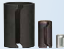
Dowel Bushings / Spring Dowels