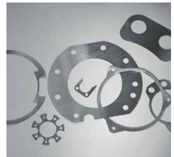
Single Thickness Shims

Drawbacks: Requires multiple stocked Shim thicknesses to achieve the proper force during assembly.