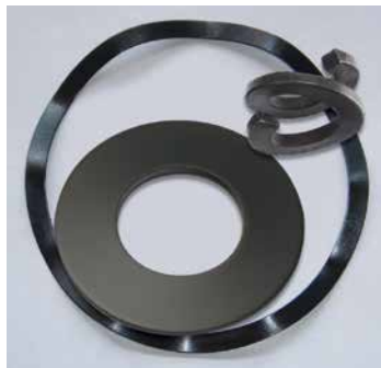
Wave Spring, Belleville Washer and Coil Spring

Drawbacks: Dissipating preload as spring fatigues, and allows yield during impact which may be detrimental to assembly (such as with a ring and pinion meshing gear set). Difficult to adjust.