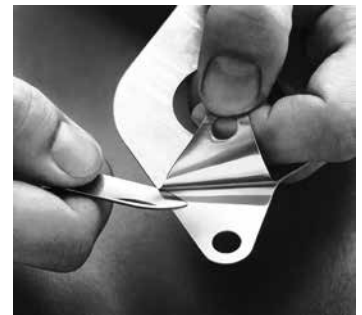
Surface Bonded Shims

Drawbacks: Sometimes it is difficult to peel layers, and discarded layers must be scrapped.