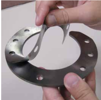
Edge Bonded Shims are easy to peel. Unused layers can be used for another application.

Benefits: Easy to peel layers. Simple and inexpensive design, maintains constant preload between service intervals, and allows for the easiest service in the field with less parts stocking. Unused layers may be used in a different assembly.